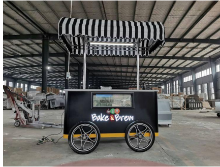
- Design Option -