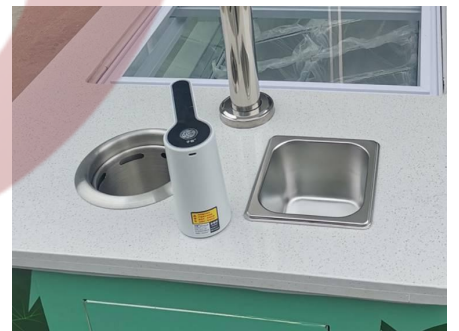
- Water Sink Kits -