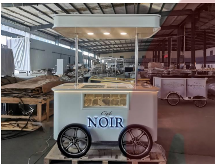
- Design Option -