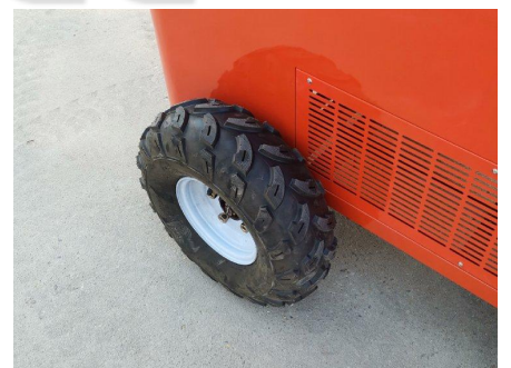
- Beach Wheels (Optional) -