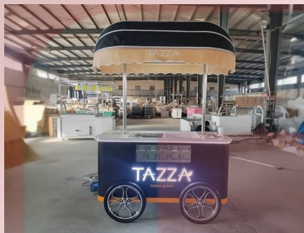
- Design Option -