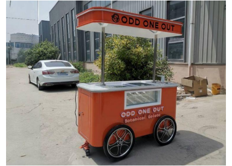
- Design Option -