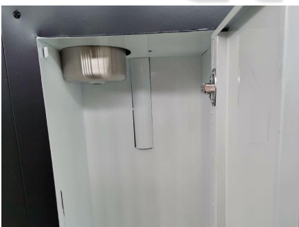
- Storage -