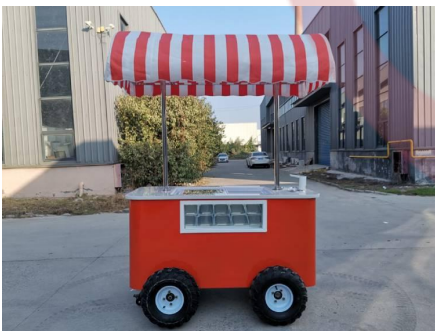
- Design Option -