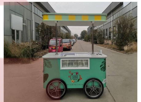
- Design Option -