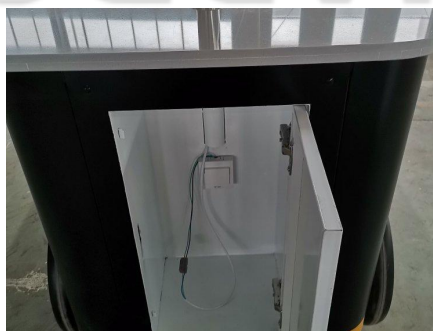
- Storage -