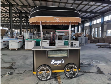
- Design Option -